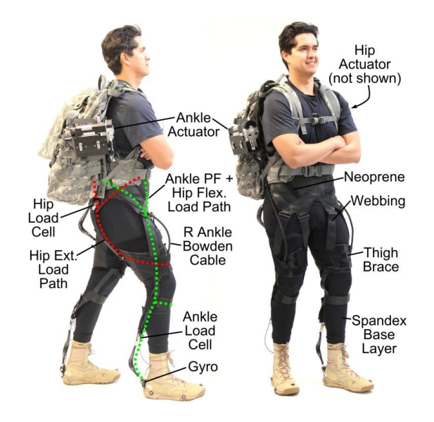
Figure 1: Load paths and components of the suit. An actuator is mounted on each side of the backpack and is connected to the suit with Bowden cables (the hip actuator is obscured). The suit includes load paths to actuate hip extension and the combination of ankle plantarflexion and hip flexion. Load cells are mounted where the Bowden cable sheaths connect to the suit, and a gyroscope is mounted on each heel.

use flexible actuation systems, detect the body's motion with movement sensors and suit tension measurements, and utilize control systems to work in synchrony with the body. Most recently we have developed a multi-joint soft exosuit that utilizes an innovative actuation concept to provide assistance to the ankle and the hip joint. This exosuit assists walking by creating ankle plantarflexion and hip flexion joint torques through a multi-articular load path, as well as hip extension torques as shown in Figure 1.