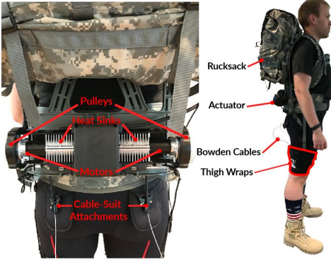
Figure 1: System actuator and soft exosuit components

Background & Purpose: Wearable soft exosuits have been developed to as a way to provide gait assistance. Previously, our lab has created a multi-joint exosuit that powered both the ankle and hip joint to provide walking assistance [1]. In order to create a smaller and lighter system, we proposed a exosuit that provides assistive torque to only the hip joint. Furthermore, we recently showed that it is possible to reduce net metabolic expenditure during not only walking but also jogging by assisting hip extension with an off-board system [2]. The objective of this study was to develop a robust and portable hip-only system capable of providing consistent external assistance to the hip joint for both overground walking and jogging.